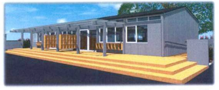
Concept drawing of new Room 13 connected to upgraded Room 10

Many thanks for considering a gift to our School, Geraldine Primary School Board of Trustees