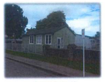
Current Room 13

Should they wish, donors will be recognized for the following levels:Bronze: $250 - $499Silver: $500 - $1,999Gold: $2,000 - $4,999Platinum: $5,000+