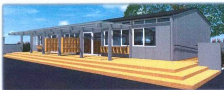
Concept drawing of new Room 13 connected to upgraded Room 10

Many thanks for considering a gift to our School, Geraldine Primary School Board of Trustees