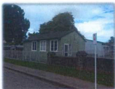
Current Room 13

Bronze: $250 - $499 Silver: $500 - $1,999 Gold: $2,000 - $4,999 Platinum: $5,000+