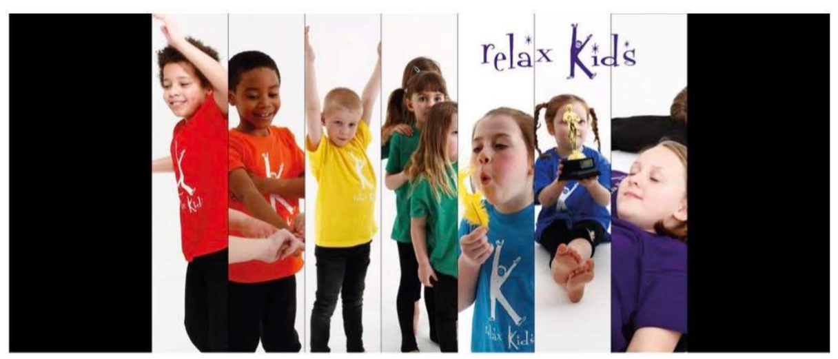
Creating calm confident children